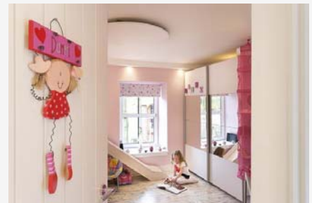
Round Heating Panel From £475,00