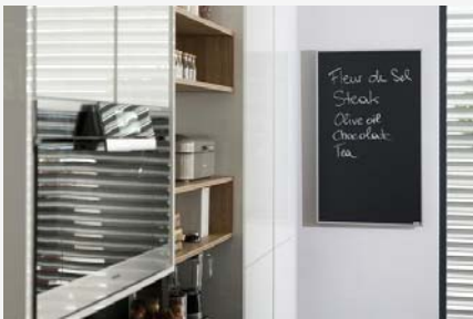
Blackboard Heating Panel From £575,00