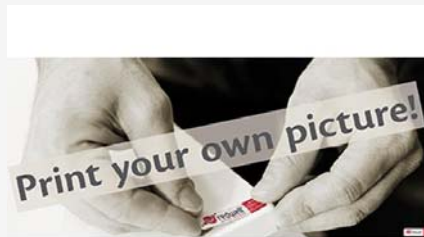
Standard Picture Heating Panel From £375,00