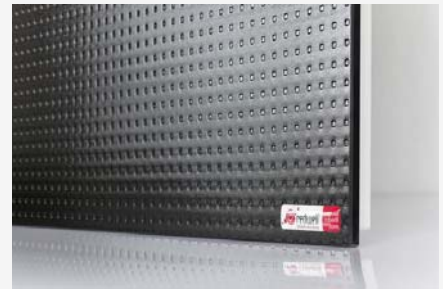
Glass Heating Panel From £625,00