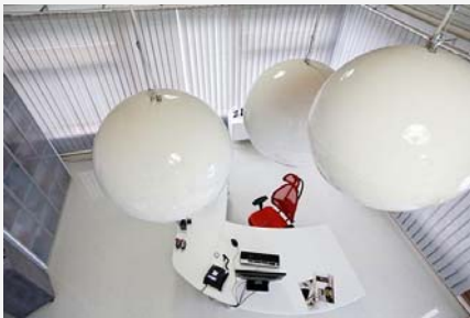
Rollingwave / Rondo From £1,195,00