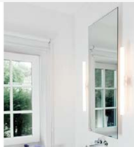
Mirror Heating Panel From £585,00