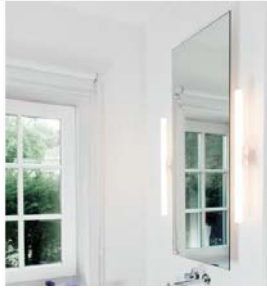
Mirror Heating Panel From £585,00