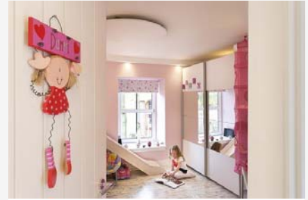
Round Heating Panel From £475,00