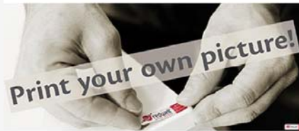
Standard Picture Heating Panel From £375,00