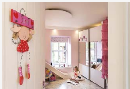
Round Heating Panel